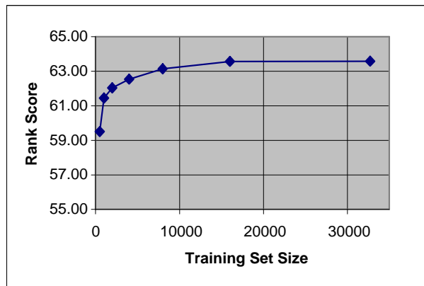
Figure 2: A learning curve showing the effect of sample size on ranked scoring for the correlation method, All but 1 protocol, MSWeb dataset.

models must be learned. Learning times for the models used in these experiments ranged from less than an hour for Nielsen and up to 8 hours for EachMovie and MS Web.